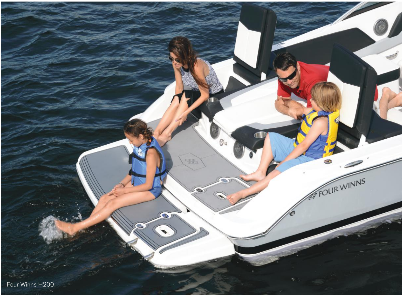
Four Winns H200