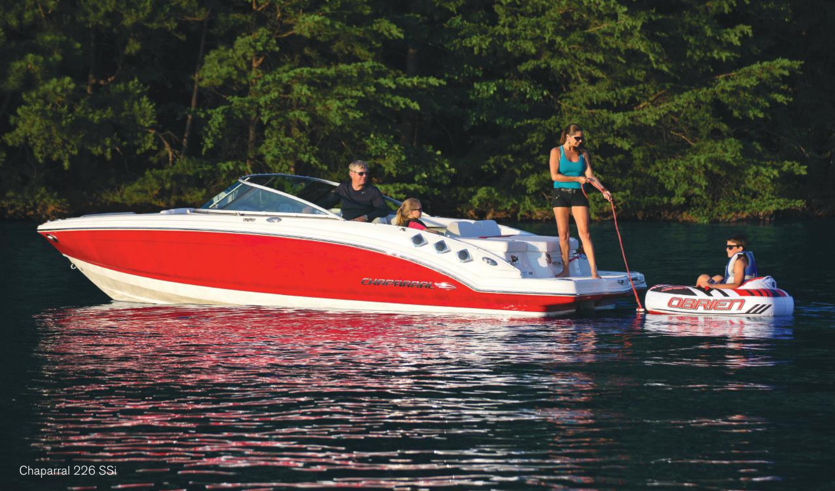
Chaparral 226 SSi